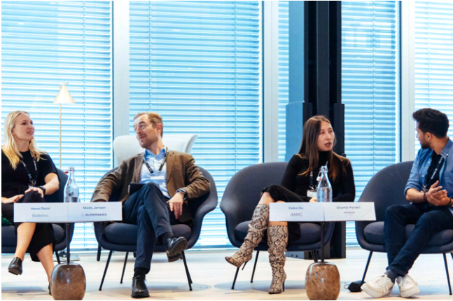
↑ Investor panel from Canute program 2022